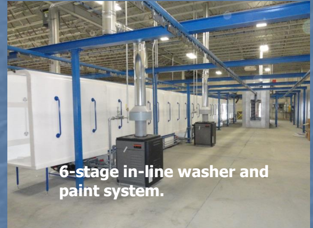
6-stage in-line washer and paint system.