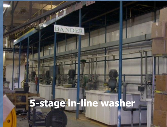
5-stage in-line washer