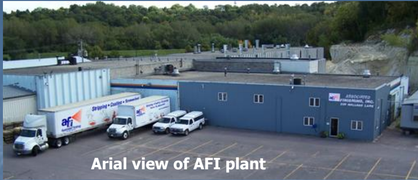
Arial view of AFI plant