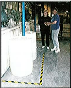
Setting: A place for everything and everything in it's place!

For many months, AFI employees have been learning about the concept of Lean Manufacturing as a way to improve the efficiency, productivity, and profitability of their workplace. But, on Thursday October 13th, we actually began to "walk our talk". This was 5S Day! Everyone came to work dressed in 'grubbies' to begin the monumental task of Sorting, Setting, Shining, Standardizing and Sustaining (improvements) in their work environment! It was truly a 'Sight to Behold'.