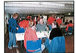
Discussing methods to Sustain our improvements