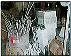
Red tagging unwanted items