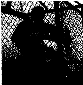
Joe Appelhof waited for a brave soul to step up