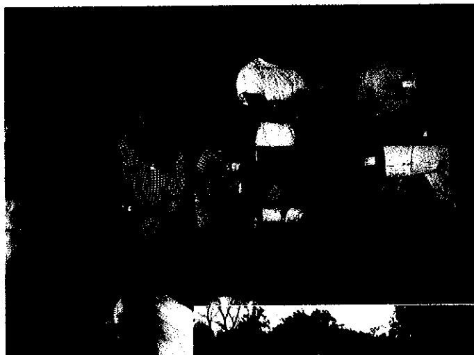
the trout pond attracted a lot of attention