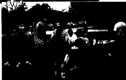
the weather was great for grilling and visiting