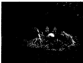
Below: Teams must locate specific objects buried within the hay