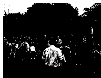
Teams demonstrate their prowess@ Shootin'Hoops

Powder Coating -- Liquid Coating -- Pad Printing Paint Stripping -- Silkscreening -- R.F.I. Shielding