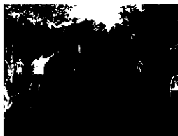
Above: A skill every liquid painter must masters well!

In our unique rendition of the popular television show, AFI's volunteer "SURVIVORS" were randomly divided into the Blue, Yellow & Orange teams you see below. Each Team needed to use both the combined and individual talents and prowess of it's members to outwit, outlast and outplay rival teams! Spectators and challengers alike, were given the opportunity to place bets (fake funds, of course!) on the outcome of the competition, which ultimately translate into increased chances at winning the drawings for a gazillion prizes purchased by the planning committee! Our "End of Summer Festival" saw the BLUE TEAM emerge victorious!